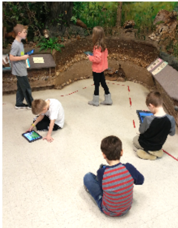
At the E.B. Shurts building