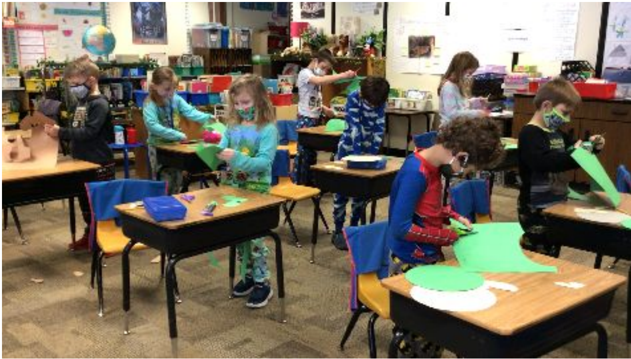
Making Frog and Toad