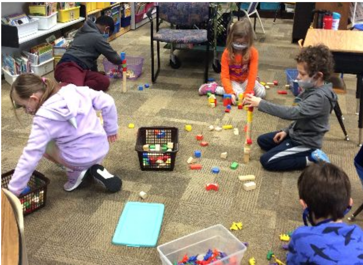
Having indoor recess while social distancing