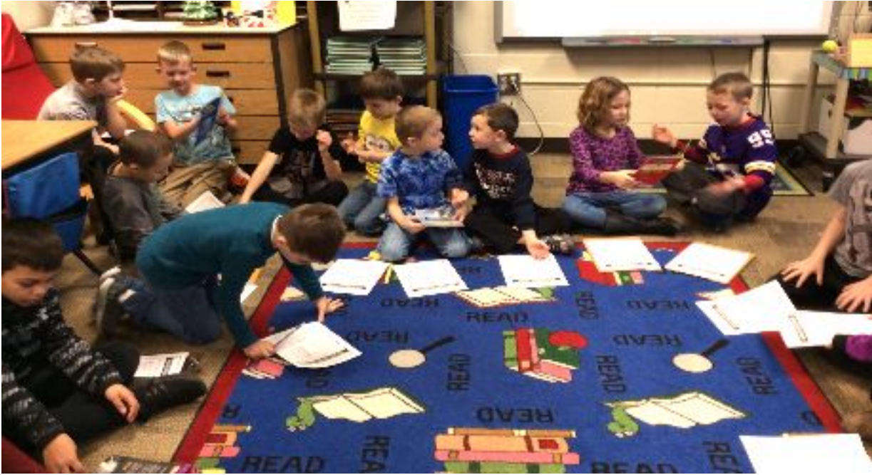
Finding Nonfiction Text Features